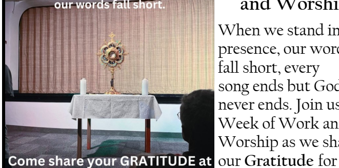
Week of Work and Worship