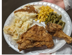
The Celestine Community Club cooks served an outstanding meal!